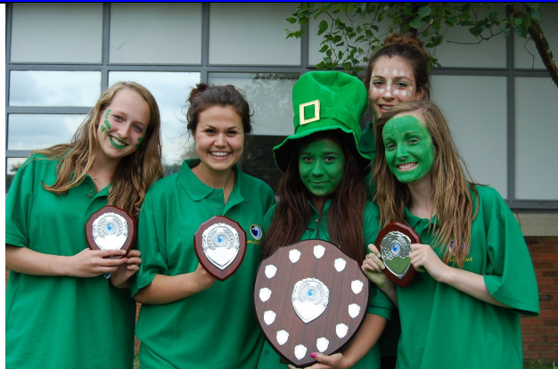
The winners - Eliot House