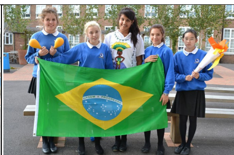
Runners up were Brazil