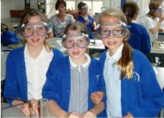
Two classes of Year 5 pupils from Archdeacon came in for practical science lessons